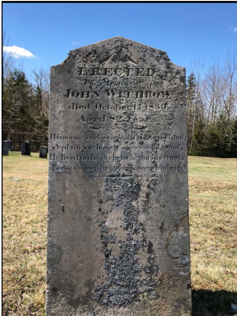
Saint Paul's Anglican Church Cemetery Centre Rawdon, Hants County