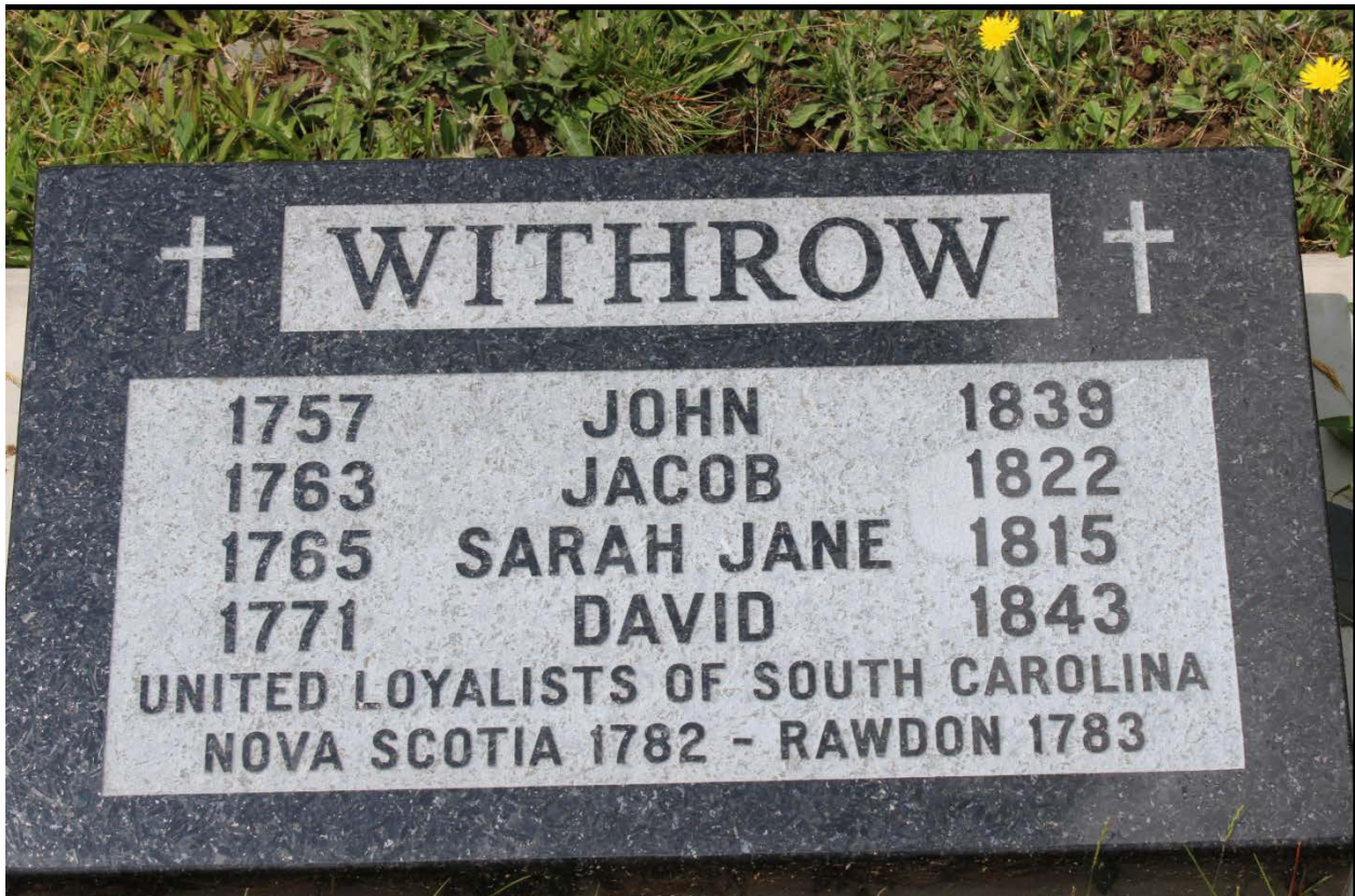
Saint Paul's Anglican Church Cemetery Centre Rawdon, Hants County