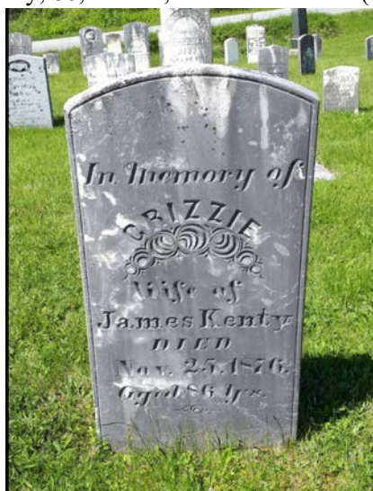
Nine Mile River Cemetery